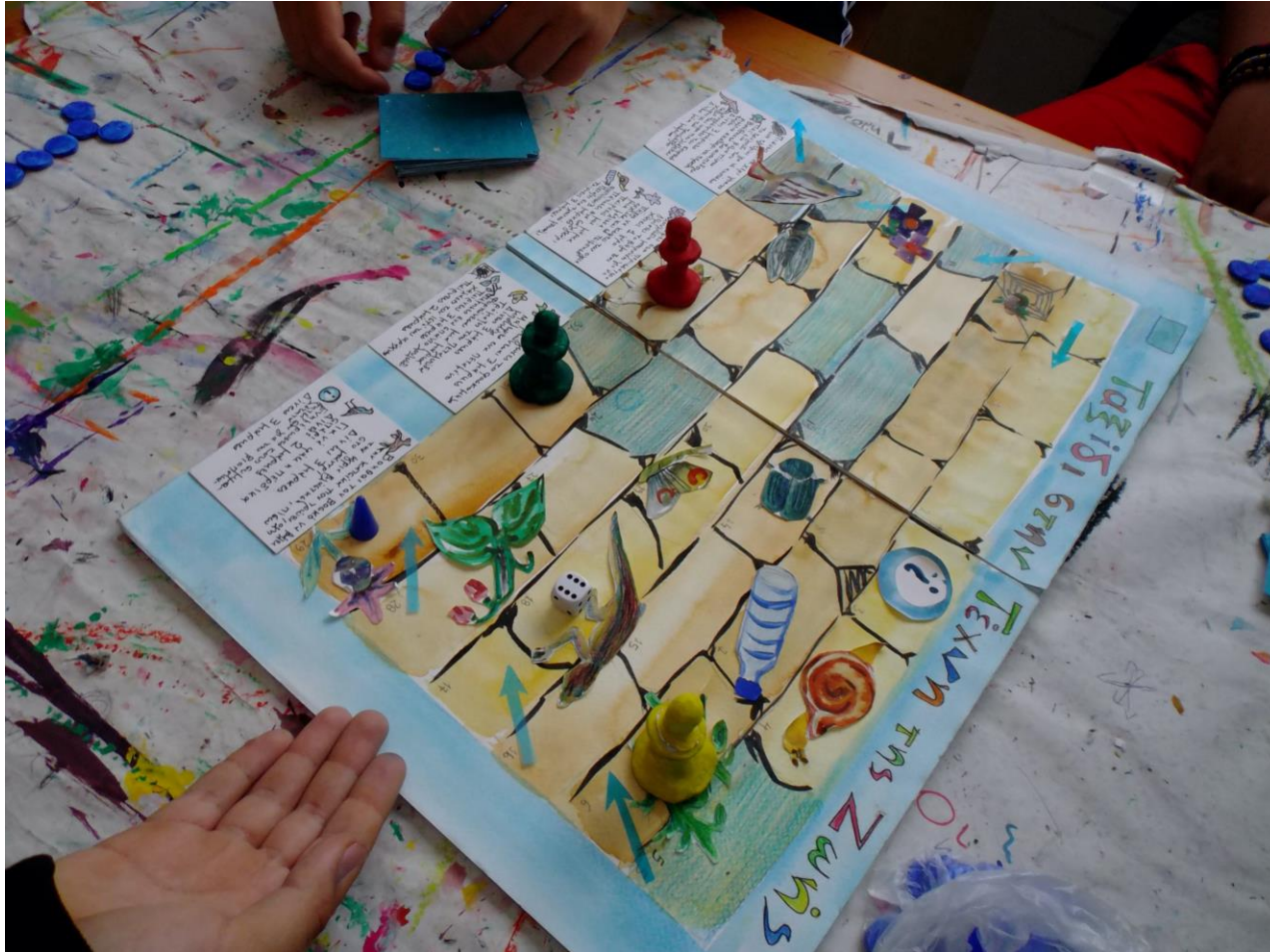
Elementary school boardgame on dry stone walling

Encouraged and requested in all the stages of implementation