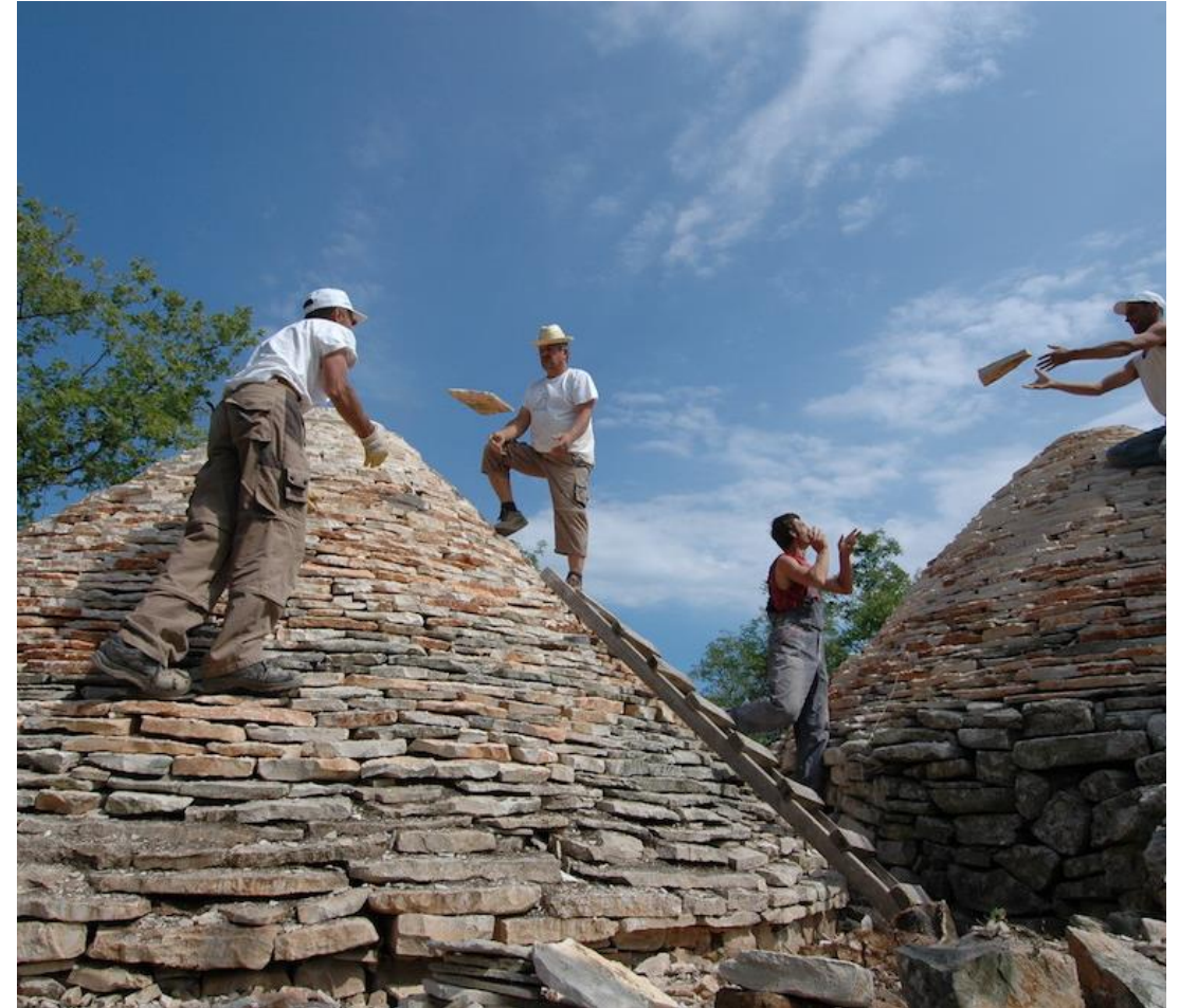
Dry Stone Walling